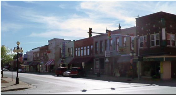
McCordsville, in Hancock County