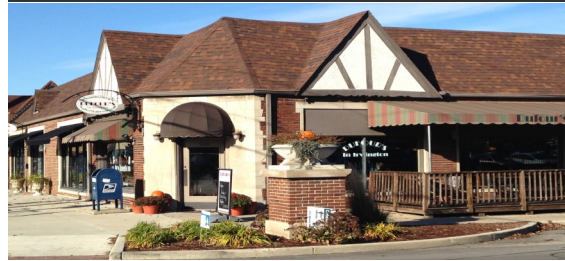
(Multi-ethnic Work) Irvington, in Marion County