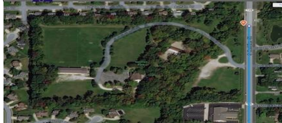
River South (Indy), in Marion County