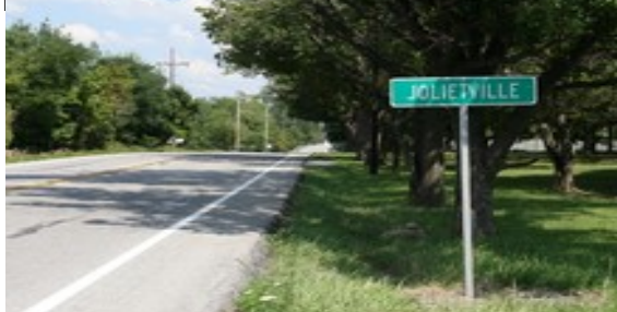
Jolietville, in Hamilton County